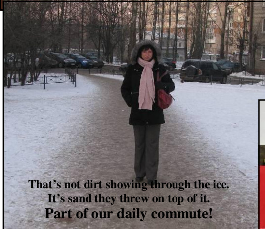
That's not dirt showing through the ice. It's sand they threw on top of it. Part of our daily commute!