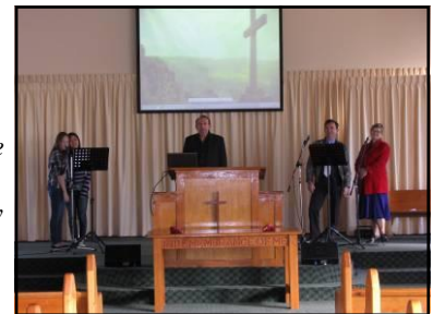
Our HBC Praise Team