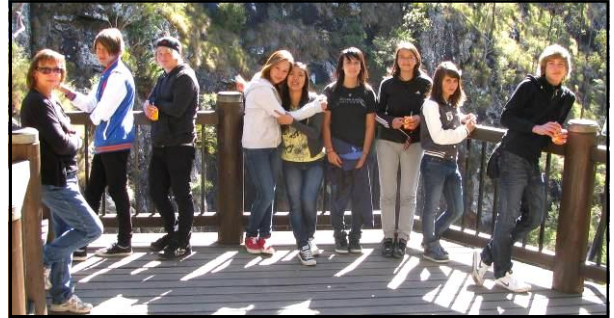
Youth Group from Hinterland Baptist Church